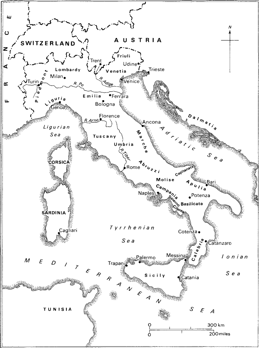
Italy in 1870