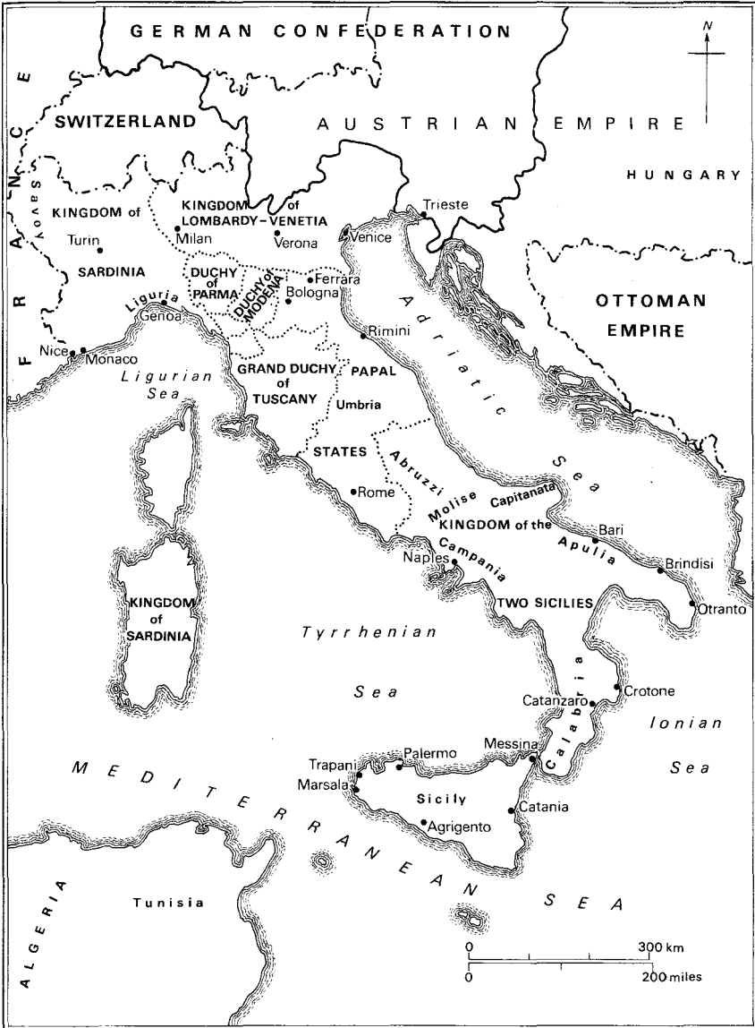
Italy in 1815